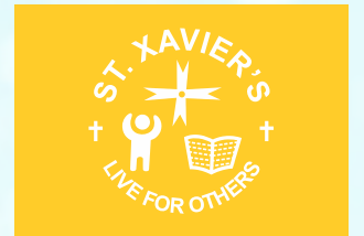
CHARITY: YELLOW HOUSE