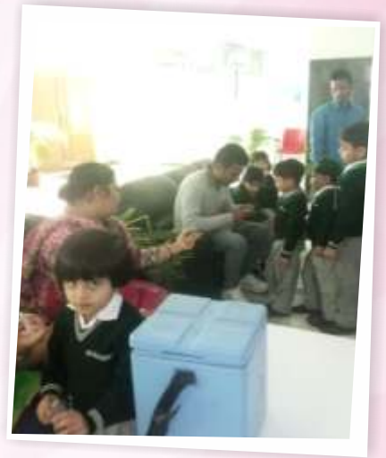
Pulse Polio Camp 19.11.18