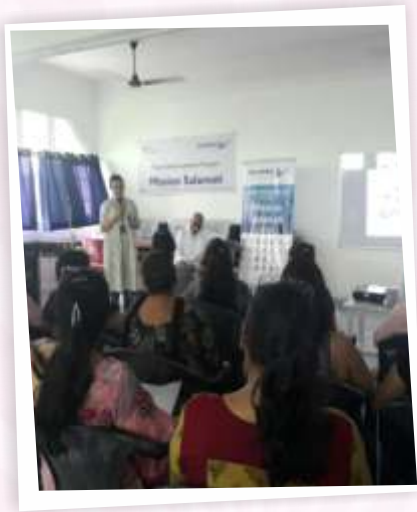
First Aid Workshop 20.08.18