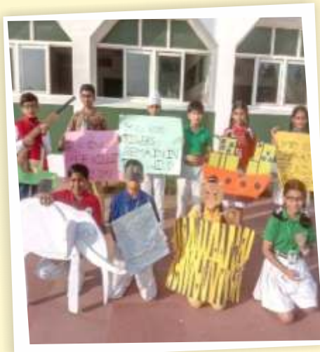
World Animal Day 04.10.18