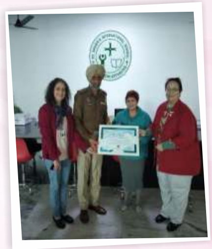
Safe School Vahan Scheme Seminar 08.02.19