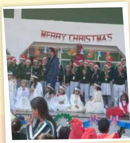
Christmas Celebration 21.12.18