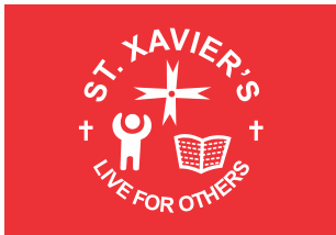
HONESTY: RED HOUSE