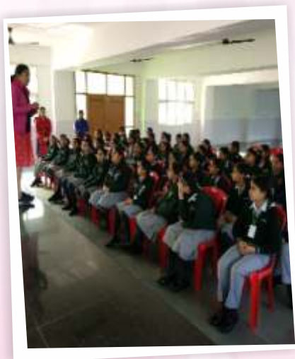
Health and Hygiene Workshop 25.02.19