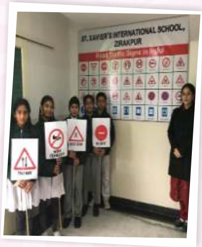
Traffic Rules Workshop 06.02.19