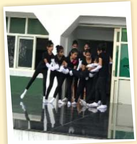
Children's Day 14.11.18