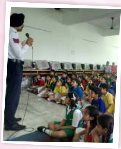
Road Safety Drive 10.07.18