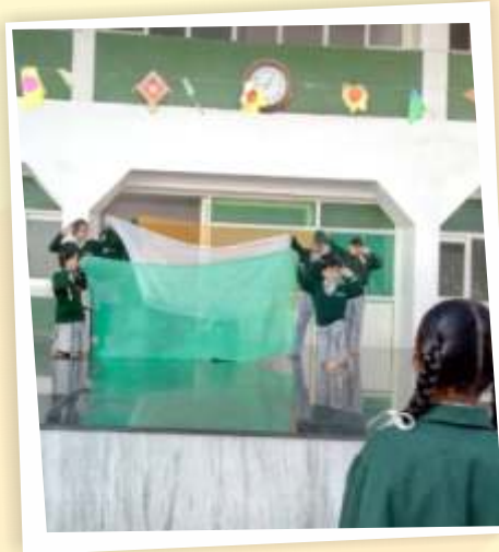
Independence Day Celebration 14.08.18