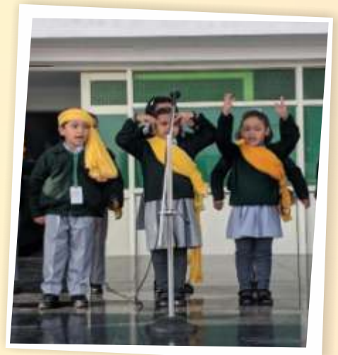
Basant Panchmi 08.02.19