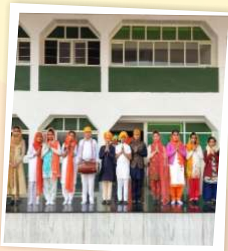
Gurupurab Celebration 22.11.18