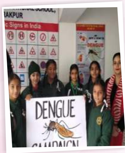
Dengue Awareness Camp 15.01.19