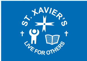
HOPE : BLUE HOUSE