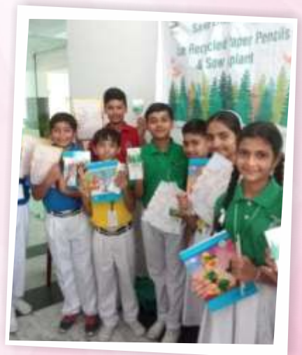
Save Trees Save Environment Week