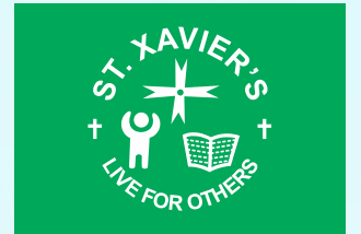
PEACE: GREEN HOUSE