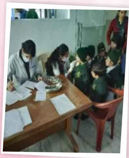
Dental Camp 20.02.19