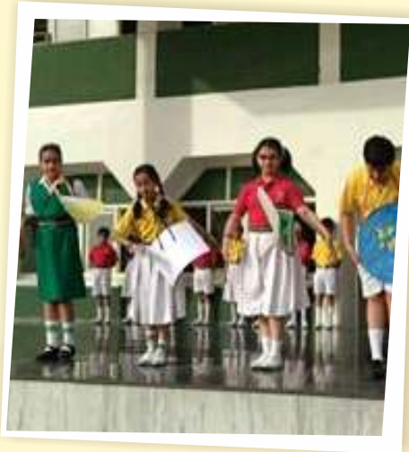
Earth Day 20.04.18