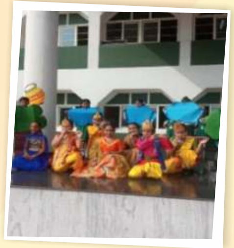
Janmashtmi Celebration 27.08.18